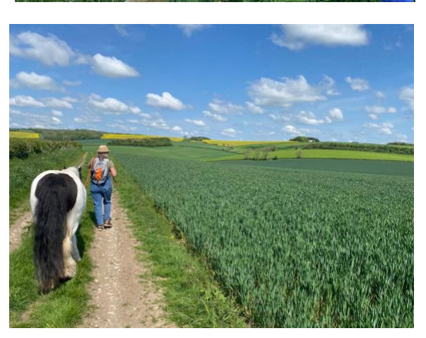
The Thimble – the perfect spot for a postwalk picnic